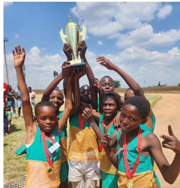
Learners from the victorious Khayaletu Primary School.