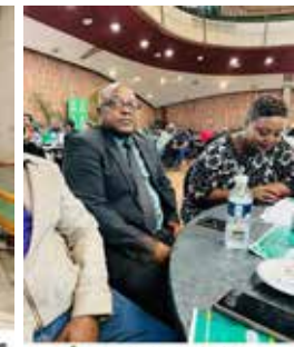
Emalahleni IDP 2025