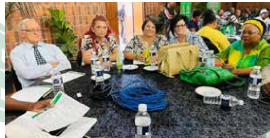
ELM IDP | VF Plus PR councillors