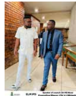
ELM IDP | Speaker of council Cllr MD Nkosi Executive Mayor: Cllr VJ Nhlapo