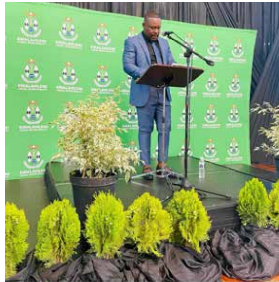
ELM IDP | Executive Mayor Cllr VJ Nhlapo

The forum served as a platform for key stakeholders, including municipal officials, ward councillors, business representatives, and community members, to engage in meaningful discussions about the municipality's developmental priorities and service delivery plans.